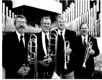
A Touch of Brass