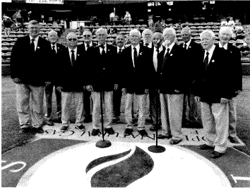
Flight 93 Memorial Chorus